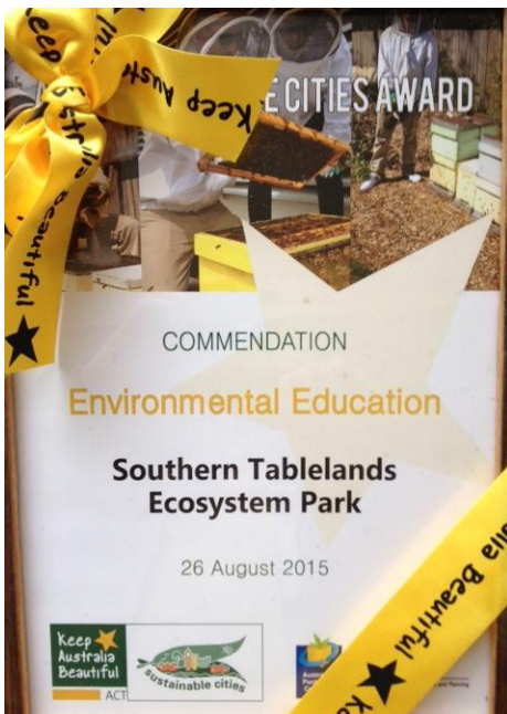
The Award from Keep Australia Beautiful (ACT).