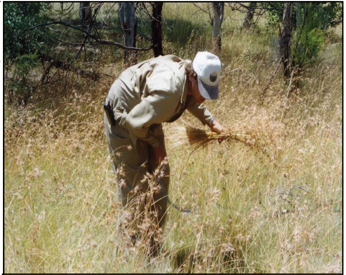
Photo by Jean Geue 2004. Block 34 National Arboretum. Harvesting Themeda a scythe.

The STEP project is on track to be part of the grand opening of the National Arboretum in March 2013.